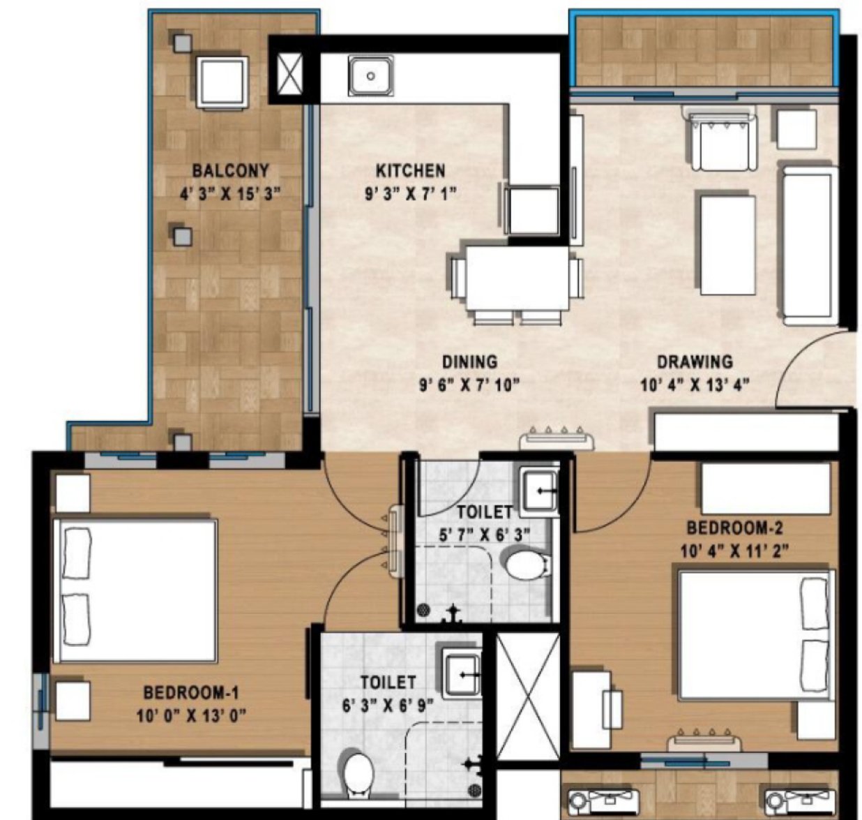
2 BHK CARPET AREA : 59.53 sqm. (640.77 sq.ft.) BUILT UP AREA : 74.34 sqm. (800.19 sq.ft.)

Unlike the conventional old age homes, Second Innings Homes would have state of the art facilities and standards well established internationally.