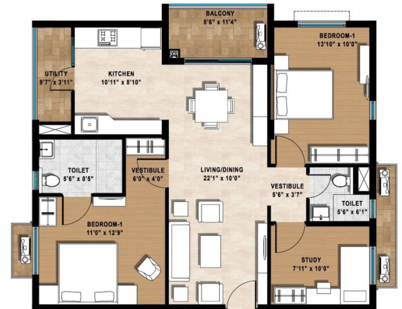
2.5 BHK ( 2BHK + STUDY) CARPET AREA : 79.45 sqm. (855.19 sq.ft.) BUILT UP AREA : 97.21 sqm. (1046.35 sq.ft.)